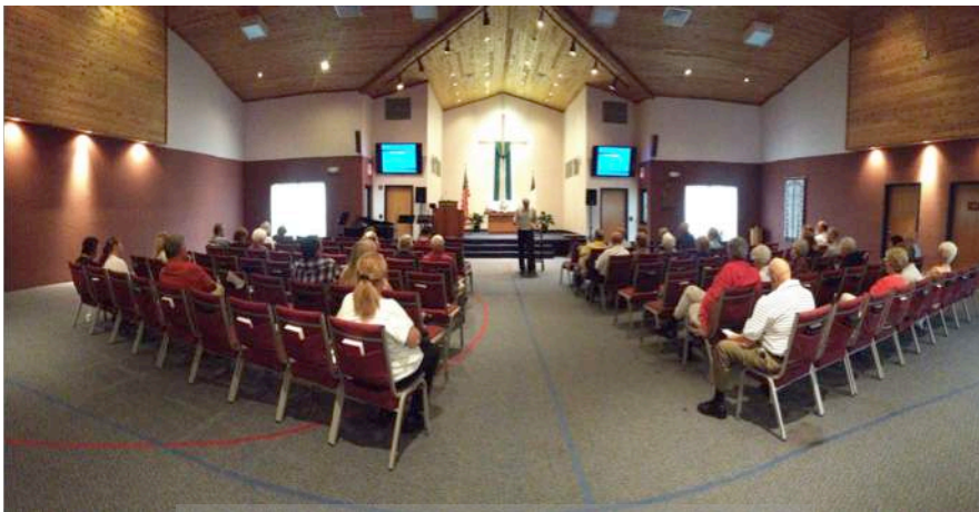
Missed you last Sunday. I am still saving a seat for you. Your friend, Jesus