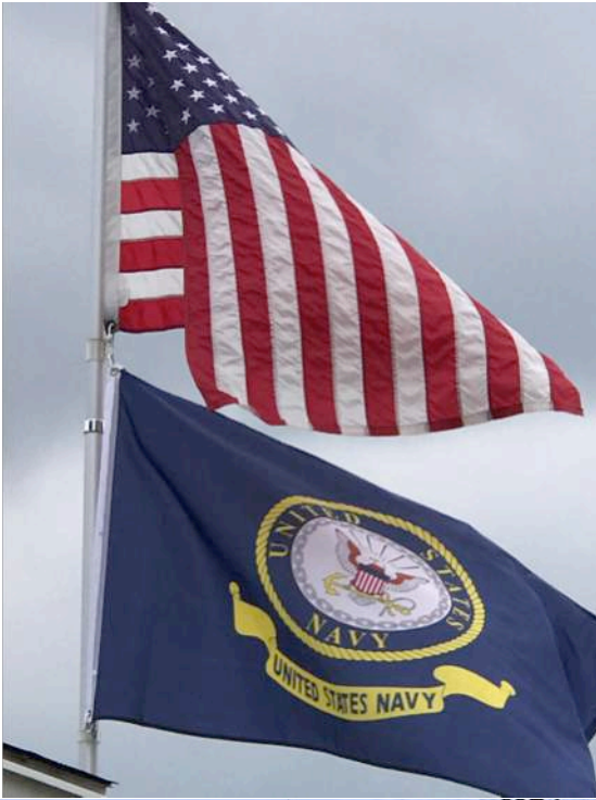
USS Vogelgesang DD862